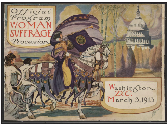
Official program - Woman suffrage procession, Washington, D.C. March 3, 1913

Votes for Women banners were carried by people called suffragists . Suffragists believed that women should have the right to vote and a voice in government, just as men did. Suffragists spent many decades fighting for this right.