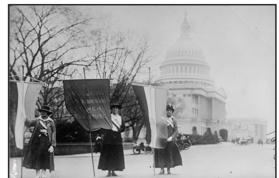
Suffrage Picket Parade at the U.S. Capitol, 1917

While some states gave women voting rights, many states did not. Banners were one way to gain the public's attention and support. In 1920 after decades of struggle, the 19th Amendment to the Constitution extended the right to vote to millions of women. The amendment marked one step in a long fight to win equal voting rights for all Americans.