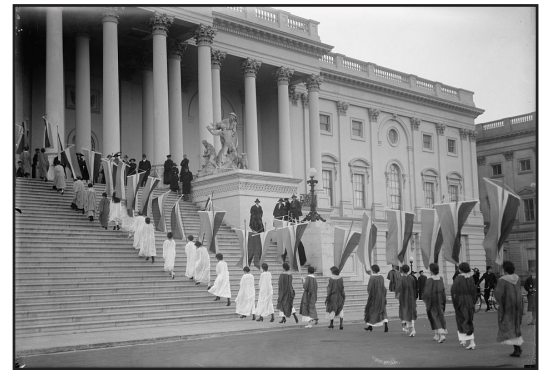
Suffragists carrying banners at the U.S. Capitol